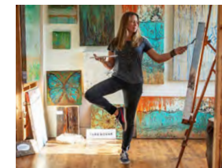
VAIL VALLEY CHARITABLE FUND

Vail Health provides 3 Certified Athletic Trainers to engage with high school student athletes in helping them overcome injuries and not have to come to a clinic for an appointment because of their injury.